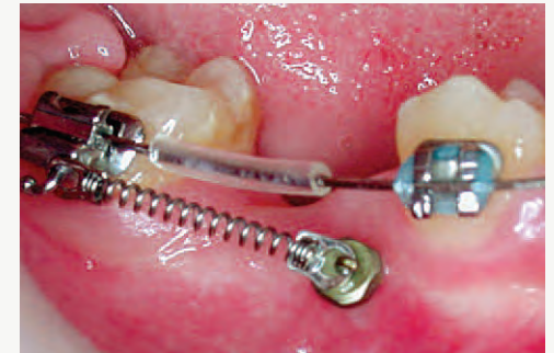
A TAD serves as an anchor to perform difficult tooth movements predictably.

Because orthodontists have the training and expertise to place them, many orthodontists place TADs themselves. This ensures the TAD is placed exactly where the orthodontist wants it. Some orthodontists may choose to have a TAD placed by another dental specialist.